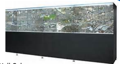
For Christie Entero HB Video Wall Cubes

Models: RPMSP-LED02, RPMHD-LED02, RPMWU-LED02